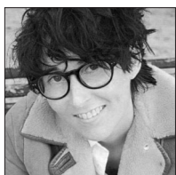
Lara Bloom April 6: The international work of The Ehlers-Danlos Society April 7: 2017 criteria: what do they mean for patients?